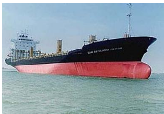
Container Ship 1.600 TEU'S