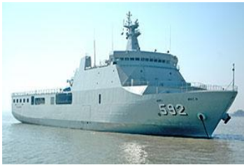
Landing Platform Dock 125m