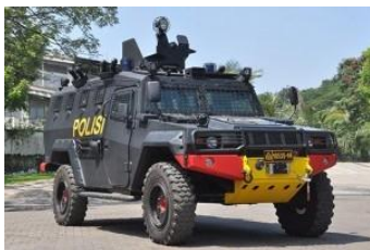
APC 4 x 4