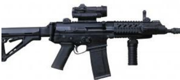
SS2-V5 A1 CAL. 5.56 MM