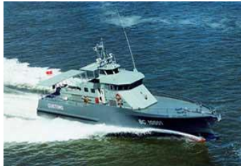
Fast Patrol Boat 28 m