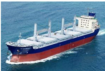
Star 50 – DSBC 50.000 DWT